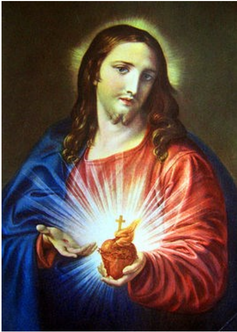
Sacred Heart of Jesus Pompeo Batoni (1708-1787)